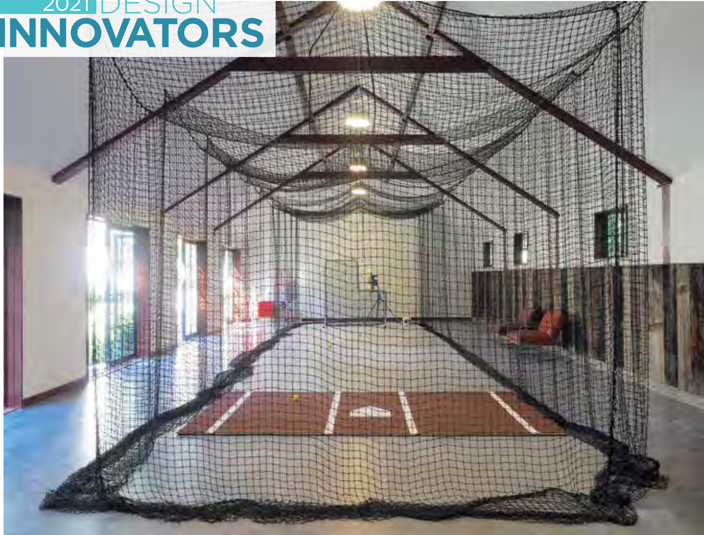
Multi-functional Masterpiece CAROL KURTH ARCHITECTURE + INTERIORS carolkurtharchitects.com